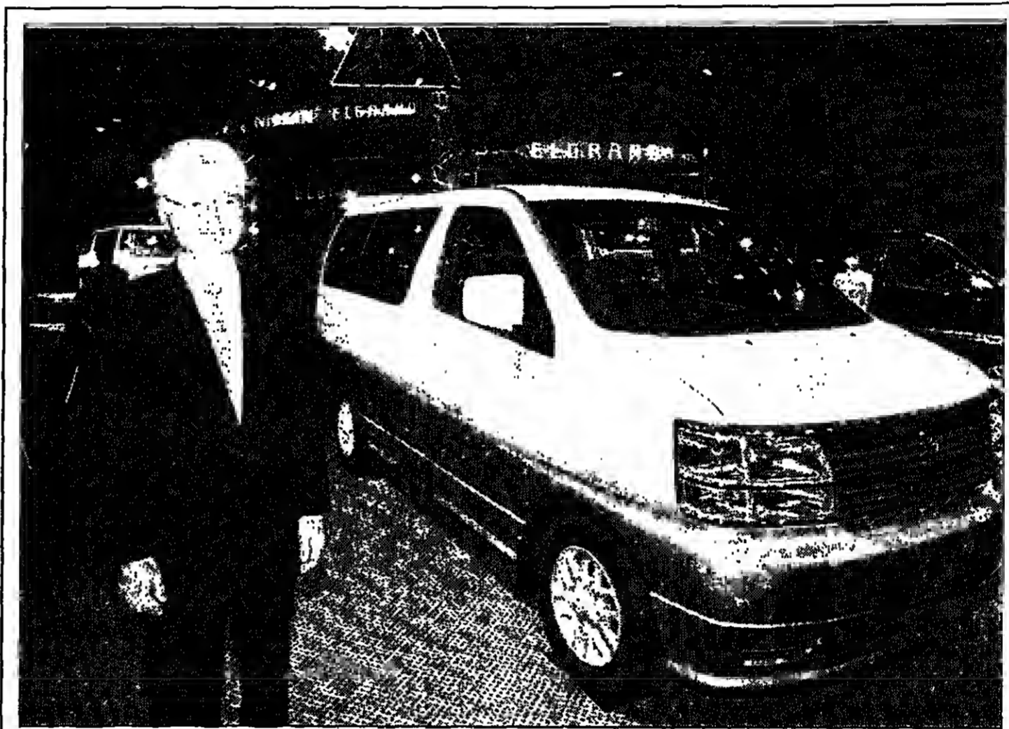
The latest model

Officials in the Finance Ministry refused to discuss the suggestion of sub-2% growth until they begin discussing the 1998 budget next month.